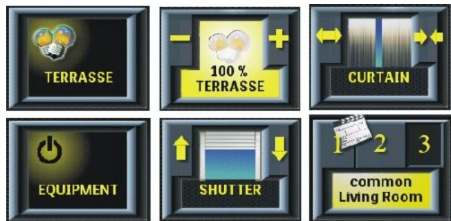
ProKNX action typicals

It is absolutely easy to generate your personalized Pronto GUI. Just define your KNX Objects for the desired action and assign them as usual with your ETS software to the appropriated group address. Then you just have to copy and paste the action typicals on one of the Pronto KNX pages.