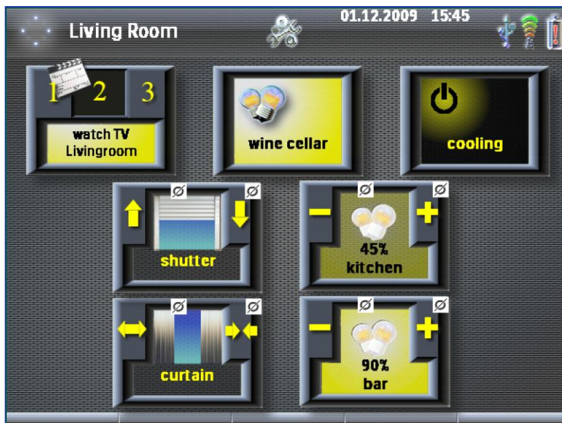
Personalized Pronto GUI

A personalized Pronto screen may look like this: